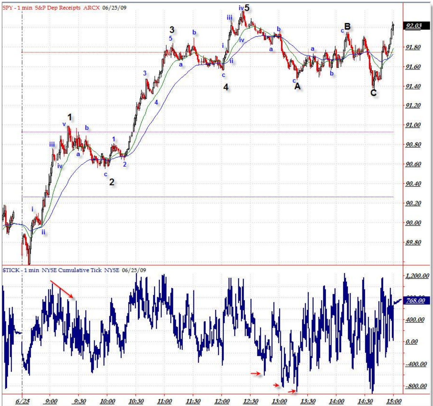
A focus on the intraday Elliott Wave fractals - which formed according to textbook fashion - for the day.